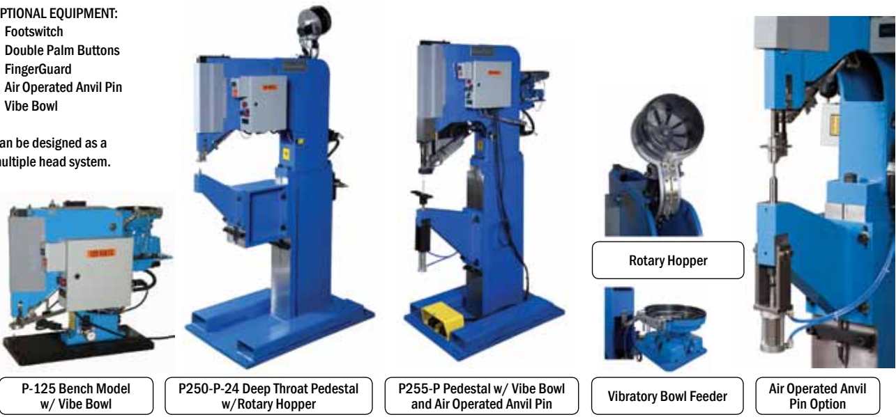
P-125 Bench Model w/ Vibe Bowl

Can be designed as a multiple head system.